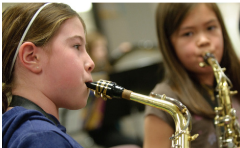
5th Grade Band

We provide a variety of academic programs and unique student activities that support students as they become the best learners and citizens they can be.