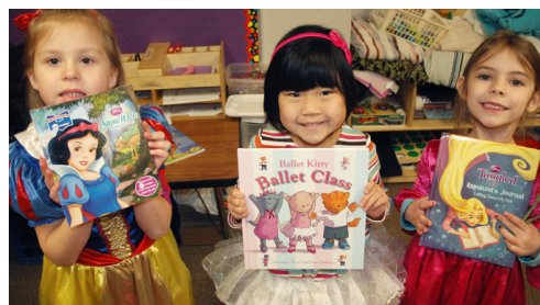
Kindergarten storybook character parade

Climate & Culture - We are committed to building strong community through service. The BurnsvilleStrong Action Club involves about 75 students in grades 3-5 performing service projects around the school and in the broader community. Our Community Garden brings parents, students and community members together to provide fresh produce to a local food shelf and students in need.