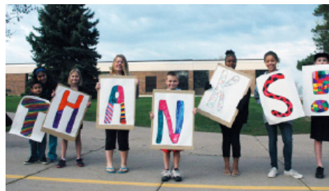
Volunteer Appreciation Drive-Thru

P.R.I.D.E. - We know that students learn best when they feel safe and part of a supportive community. Through our PRIDE program (Prepared, Respectful, Involved, Determined and Excellent), we stress the importance of good character, acknowledge those students who demonstrate it, and model it every day.